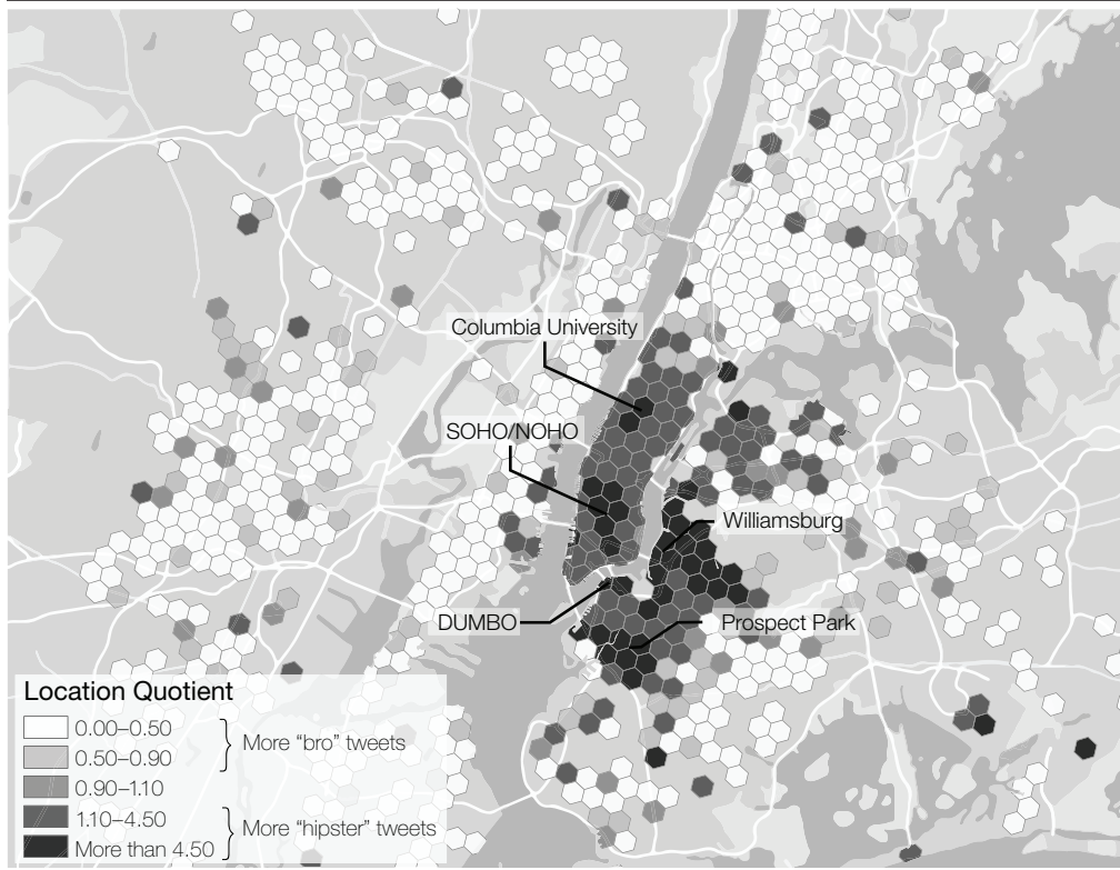
DUMBO = Down Under the Manhattan Bridge Overpass. NOHO = North of Houston. SOHO = South of Houston.

Aggregating tweets to 1,000-meter-wide hexagonal cells containing sufficiently large samples to be normalized by location quotients (LQs), 3 the resulting maps (with hexagons clipped at the waterlines for better legibility) visualize the spatial distribution of (1) “hipster” and “bro” subcultures and (2) self-identified “bankers” and “artists” as manifested within Twitter. The hipster/bro map in exhibit 1 shows concentrations of hipster references (the darkest hexagons with LQ > 1) within Brooklyn (particularly DUMBO, Prospect Park, and Williamsburg) and Manhattan (around SOHO/NOHO and Columbia University), with smaller clusters scattered elsewhere. This pattern corresponds well with commonly known “hipster neighborhoods” within New York and, moreover, these neighborhoods are surrounded by a more extensive belt of tweets containing “bro” (perhaps best referenced as a bro-ghnut), suggesting a relatively clear spatial divide in these subcultures.