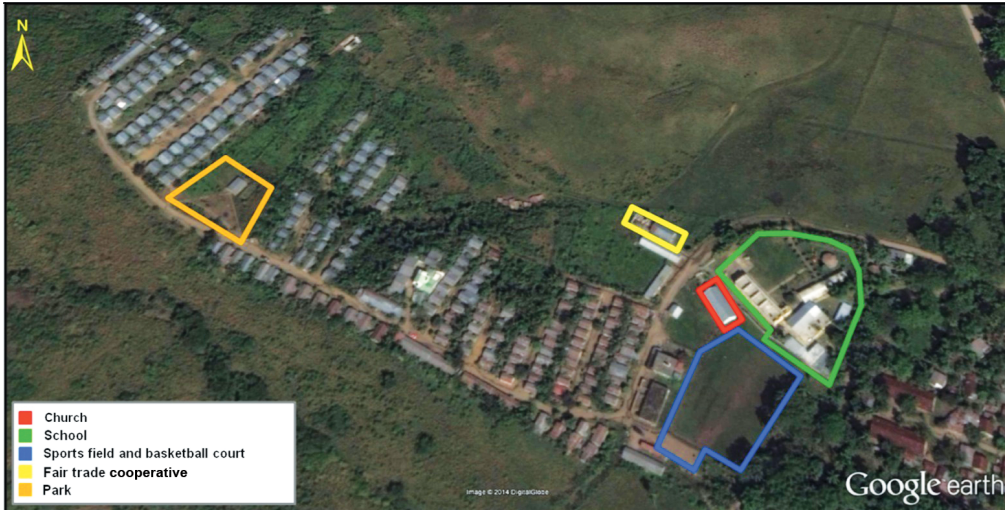
Example 1 of Community Spaces Identified As Important in Villa Ascension de Caraballo, Dominican Republic