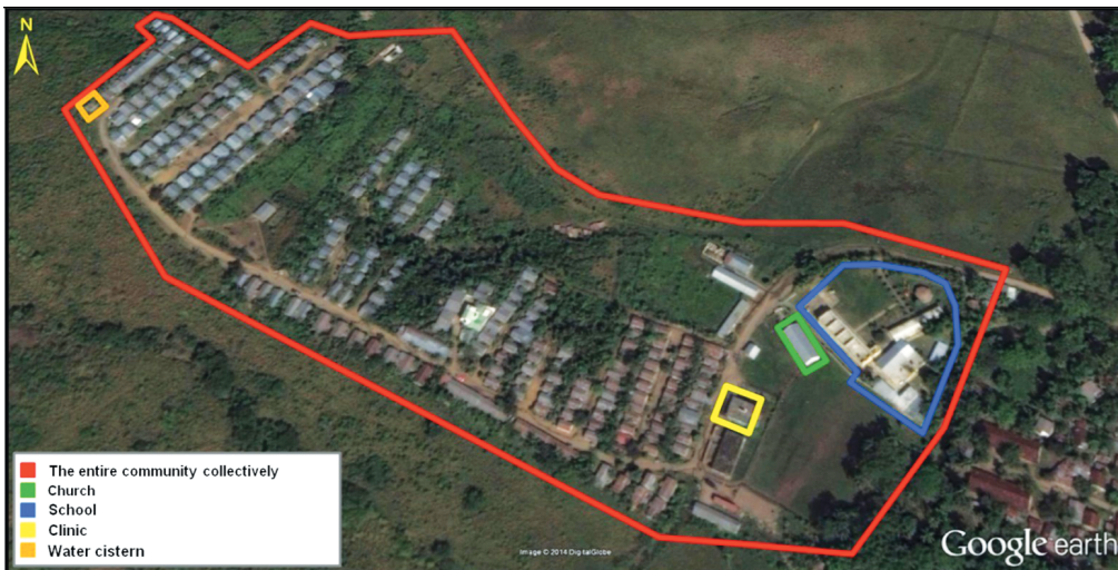
Example 2 of Community Spaces Identified As Important in Villa Ascension de Caraballo, Dominican Republic

As mentioned previously, placemarks, a Google Earth feature, enables the researcher to store data on specific spaces and places from interviews or observations in placemark textboxes. The researcher can also add images and links, as necessary; can edit data entered into each placemark by selecting “properties”; and can save data as .kmz files that can be edited at a later time. For the pilot study conducted in Villa Ascension, interviewees were asked to identify the five points in