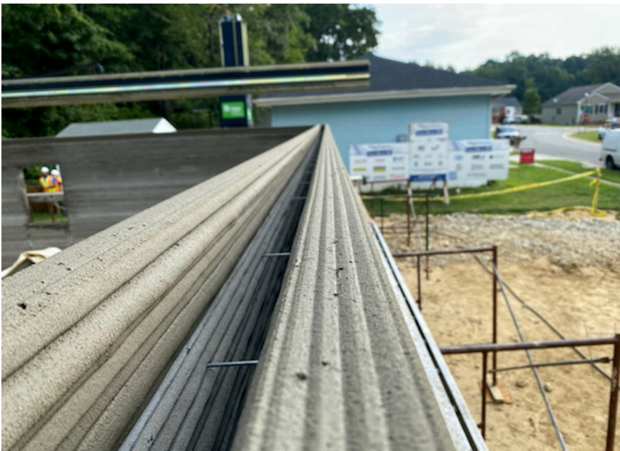
Top view of newly printed wall with metal frame for robotic gantry-arm in the background.