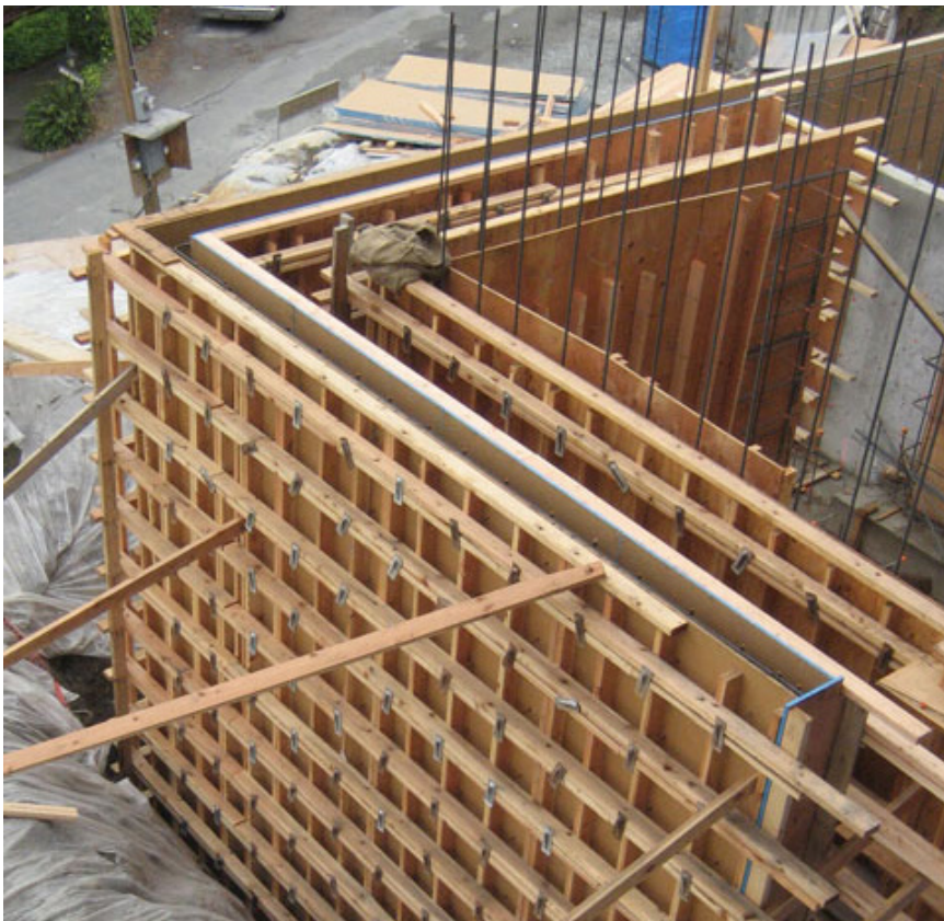
Wood Formwork Used to Pour and Harden Wet Concrete

Typical formwork construction made with wood, used in the casting and hardening of structural building components from wet concrete mixtures used in traditional concrete construction practices.