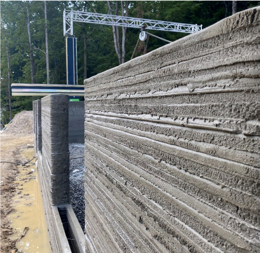
Robotic Arm Over the Frame of a Home

Partially constructed wall showing layers of concrete built with 3D concrete printer; robotic gantry-arm system is shown in the background and above the wall structure.