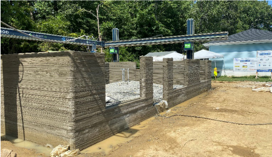
Layered walls that make up the outer frame of a home being built with 3D concrete printing construction.