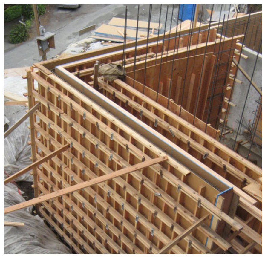
Typical formwork construction made with wood, used in the casting and hardening of structural building components from wet concrete mixtures used in traditional concrete construction practices.

Wood Formwork Used to Pour and Harden Wet Concrete