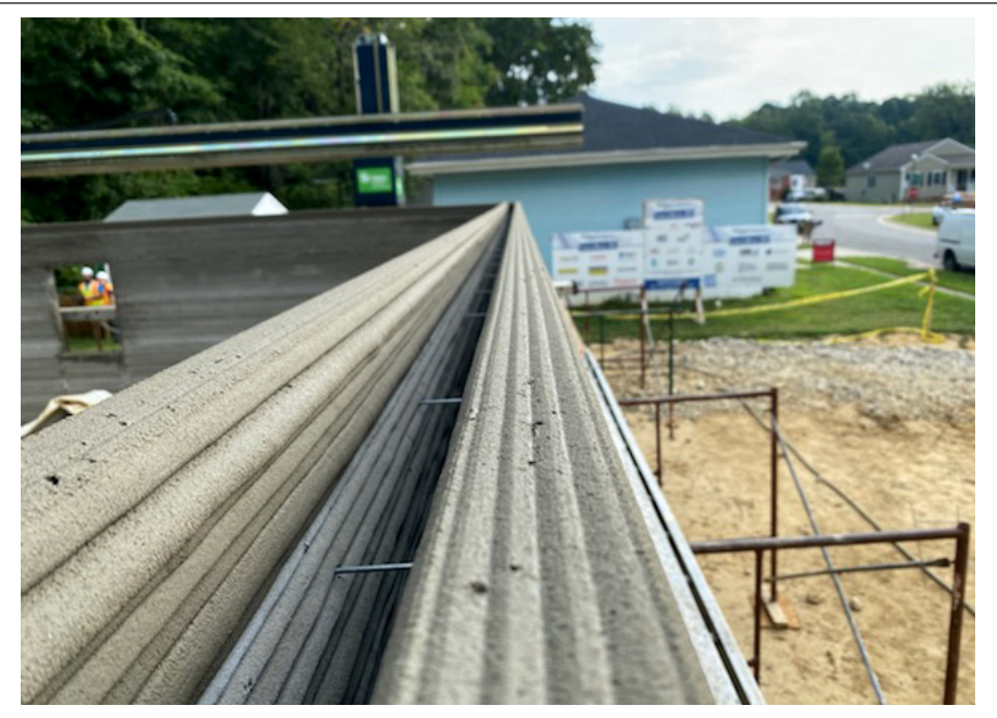
Top view of newly printed wall with metal frame for robotic gantry-arm in the background.