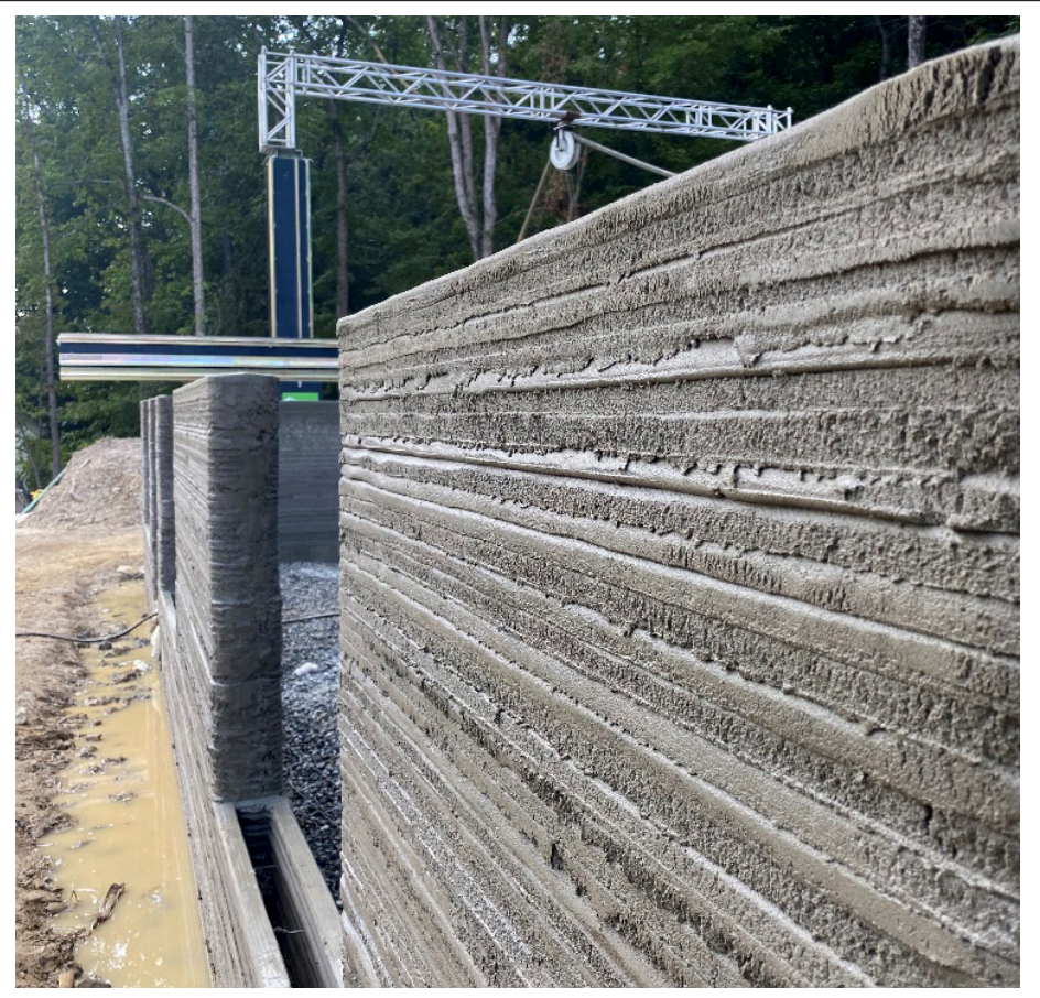
Partially constructed wall showing layers of concrete built with 3D concrete printer; robotic gantry-arm system is shown in the background and above the wall structure.