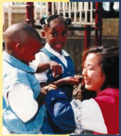
The United States Report for Habitat II