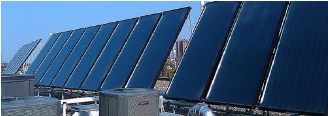
Solar skies panel to provide heat for the solar thermal system at the Wellstone Apartments in Minnesota. The power of the sun is an asset and resource that needs to be harnessed in California.