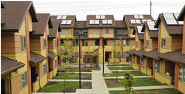
Clara Vista Townhomes, an Enterprise Green Communities affordable housing project.