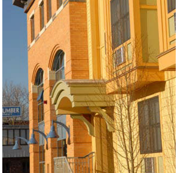
Trolley Square, an Enterprise Green Communities Project.