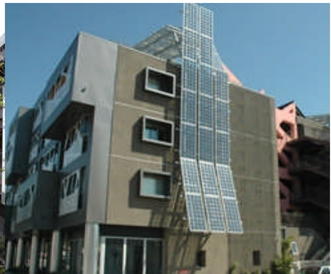
The Sierra Bonita Apartments in West Hollywood is a low-income senior housing complex that includes a variety of sustainable features, including solar panels and energy efficient appliances.