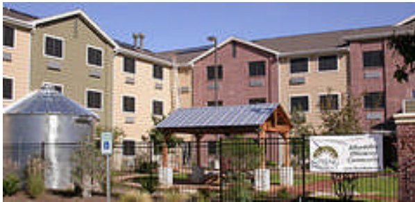
Spring Terrace Apartments, one of Enterprise's Green Communities.

This tool is intended to help in developing a manual that describes a project's green features for property management staff. An Operations and Maintenance manual is essential to optimal building performance and energy savings. It is especially important to ensure knowledge about a project's green features and mechanical systems.