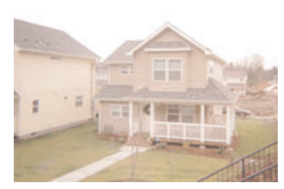
Factory-built homes that look sitebuilt retain their value (courtesy, SWA).