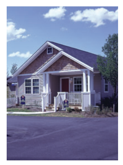
Developers should show examples of factory-built homes that fit with the neighborhood.

building officials and zoning boards unfamiliar with and skeptical about factory-built housing.