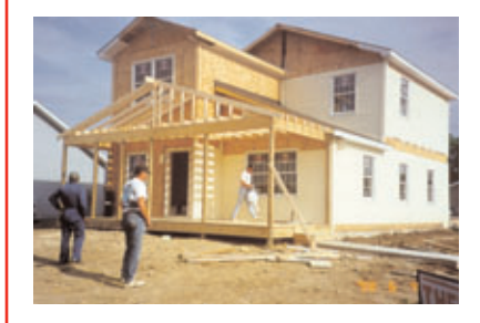
Site-built elements are the responsibility of the developer's contractor.

If the contractor is unfamiliar with manufactured or modular housing, help him or her get up to speed. Bring the contractor in from the beginning of the project during the ordering of the home and formulating a plan to manage the site and foundation work. Have the contractor learn as much as possible about the factory-built house he or she will be working with by having a briefing with a manufacturer's representative and by sending the contractor on a factory tour.