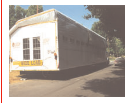
Keep neighbors informed on when house will be delivered.