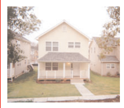
Well-designed factory-built homes can be sympathetic with existing housing.