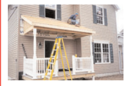
Finishing crew constructs site-built elements such as porches (courtesy, Unibilt Industries, Inc.).

Modular homes generally must meet the same code requirements as site-built homes. In most cases they are built according to a state-wide or locally amended code. Plans have to first be inspected and approved by the state or its agents. During production, licensed third-party inspectors and occasional state-sponsored inspectors will check the modules during all phases of construction and put an approval seal on each module before it leaves the plant. Installation, finish work, utility connections, and any site-built elements fall under the local code jurisdiction and local building department procedures. There can be misunderstandings, conflicts, and delays if the local inspector and developer disagree about who has code jurisdiction over what. It is best to discuss and resolve all issues with the local inspector long before the factory-built sections arrive on the site.