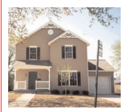
Modular homes are available in a wide array of floor plans and styles (courtesy, Unibilt Industries, Inc.).

Since modular home manufacturers often compete directly with site builders they're apt to offer a wider range of floor plans, upgrades, and combinations and allow for more customization. There is a wide spectrum of modular home manufacturers who deal in anything from low-end nofrills models to multi-million dollar mansions. The modular companies that will probably appeal most to nonprofit groups will likely fall somewhere in between. Here are some points to consider: Because urban sites are generally small and narrow as they face the street, two-story or even three-