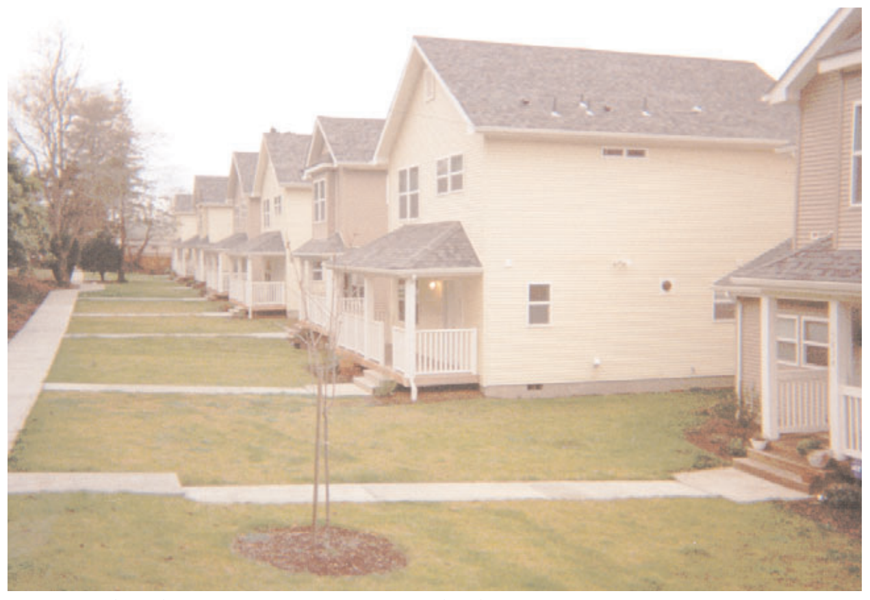
New models of manufactured homes are particularly suitable for infill sites in traditional neighborhoods.

Houses in a manufactured home plant generally move through the production line quickly with no room for modifications during production. Manufacturers who offer a variety of plans and options and who are willing to make some "custom" adjustments will likely be the ones who can best serve nonprofit developers in urban areas, but these adjustments must be completed and held firm well before production time, as they are included in production documents and "locked in" with enough lead time for ordering of special parts and materials.