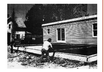
Modular home is slid on steel beams onto foundation.

the wheel wells and the 2-inch-deep steel shackles interrupt an otherwise flat basement ceiling after the home has been set.