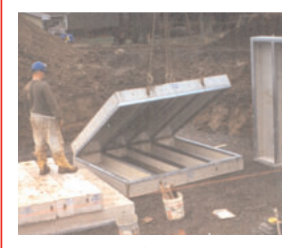
Precast concrete foundation systems.

Modular units are usually placed on foundations that are either crawlspaces or full basements. The developer's contractor is typically responsible for excavation, construction of the foundation, and