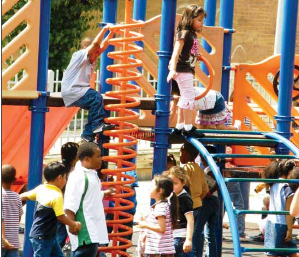
Choice Neighborhoods will coordinate with other place-based programs to improve housing, education, communities, safety, and services in areas of concentrated poverty.

HUD recognizes the importance of creating neighborhoods of opportunity, and its Choice Neighborhoods initiative is designed to deconcentrate poverty and address the interconnected problems caused by living in neighborhoods of concentrated poverty. The initiative's goal is to strengthen the underlying