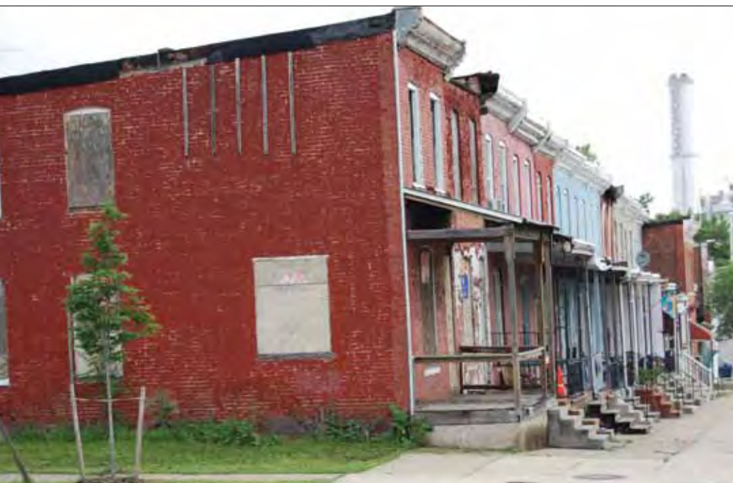
Neighborhoods of concentrated poverty can isolate residents from the services and supports they need.

The major question that continues to be asked is, does living in these places harm residents in and of itself? [Neighborhood effects are certainly not] the only factor; individual and family circumstances can overcome the effects of concentrated poverty but can also leave a family vulnerable. What is worrisome is that we don't know enough about the interaction between vulnerable families and their neighborhoods. These families are the most likely to live in poverty areas but are also the most likely to have bad outcomes no matter where they