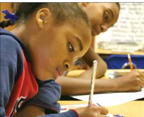
McCormack Baron Salazar