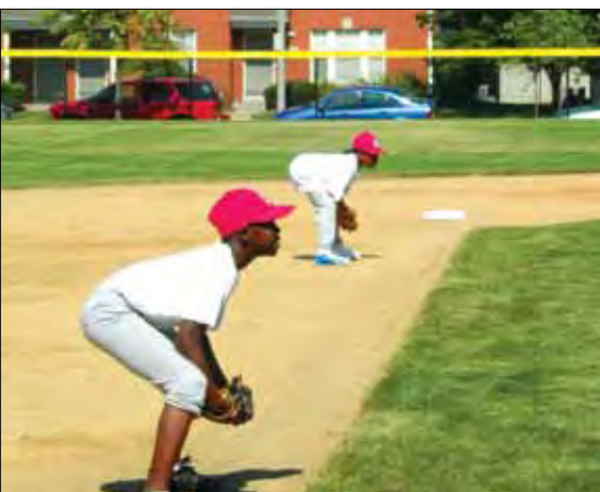
McCormack Baron Salazar

Noting these ripple effects, Zielenbach and Voith found that HOPE VI redevelopments are responsible for positive economic spillover to surrounding neighborhoods. Their study of four redeveloped sites in two cities, using changes in residential property values, crime rates, and household incomes as indicators, found mostly positive effects. They observed