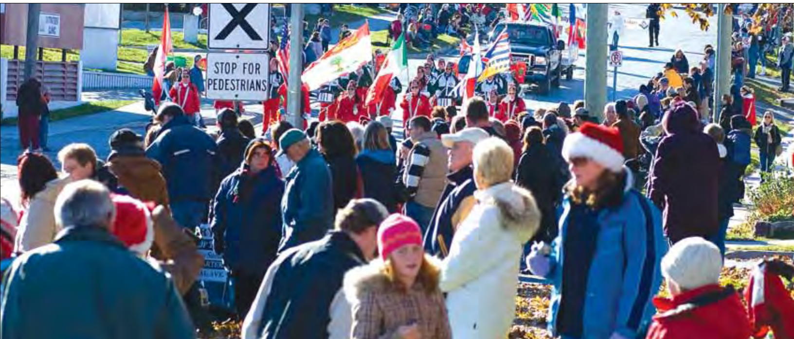
Resident participation in community capacity building efforts is necessary to meet each community's unique needs.

The Local Initiatives Support Corporation (LISC) directs public and private resources to communities based on their particular needs. In 2010 LISC created the Institute for Comprehensive Community Development to improve practitioners' access to the resources they need to advance their efforts in the field.