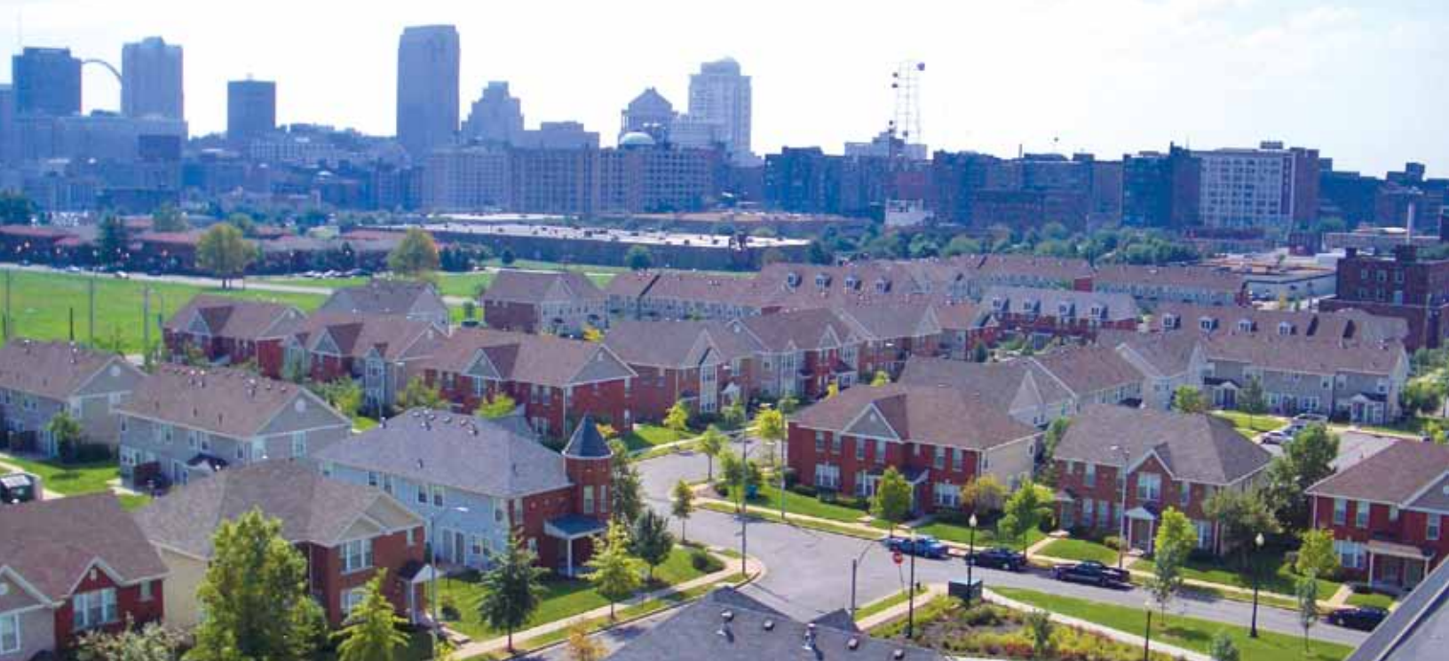
Aerial view of Murphy Park in St. Louis, Missouri, a precursor to HOPE VI mixed-finance projects.