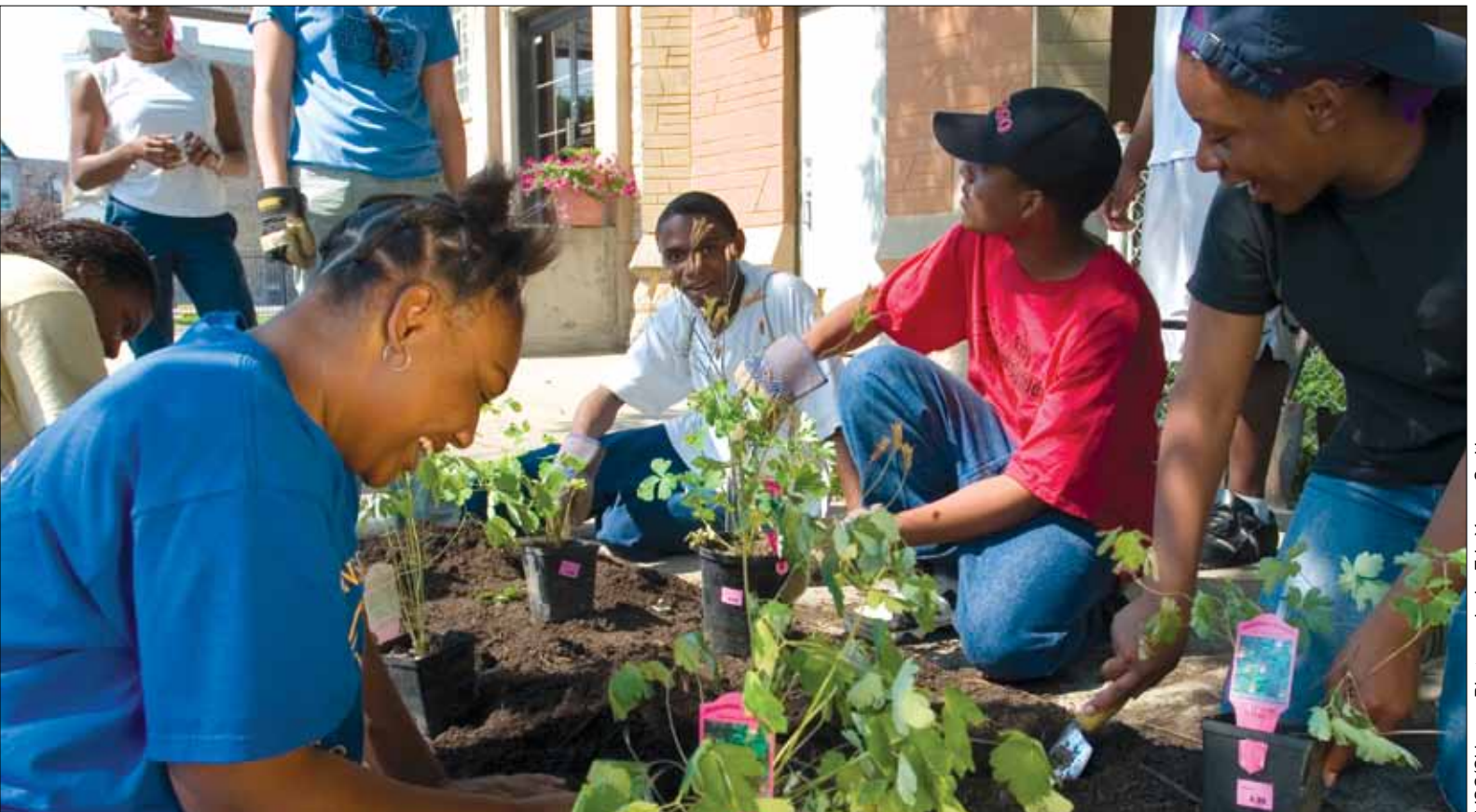
LISC/Chicago