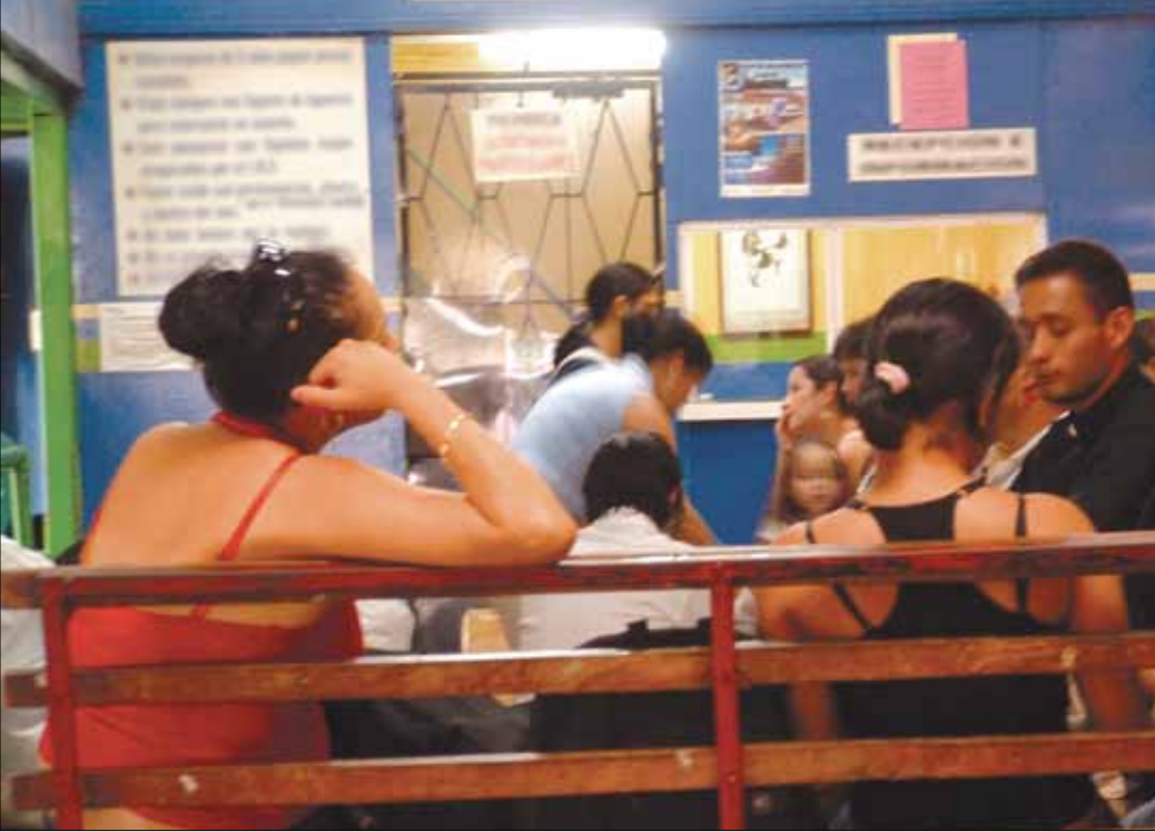
Working together to accomplish goals, strong neighborhood networks can lessen the effects of concentrated poverty.

reside. We need to learn more about the process by which a neighborhood transitions from low to high opportunity and, similarly, how that process influences individuals already affected by concentrated poverty. 3