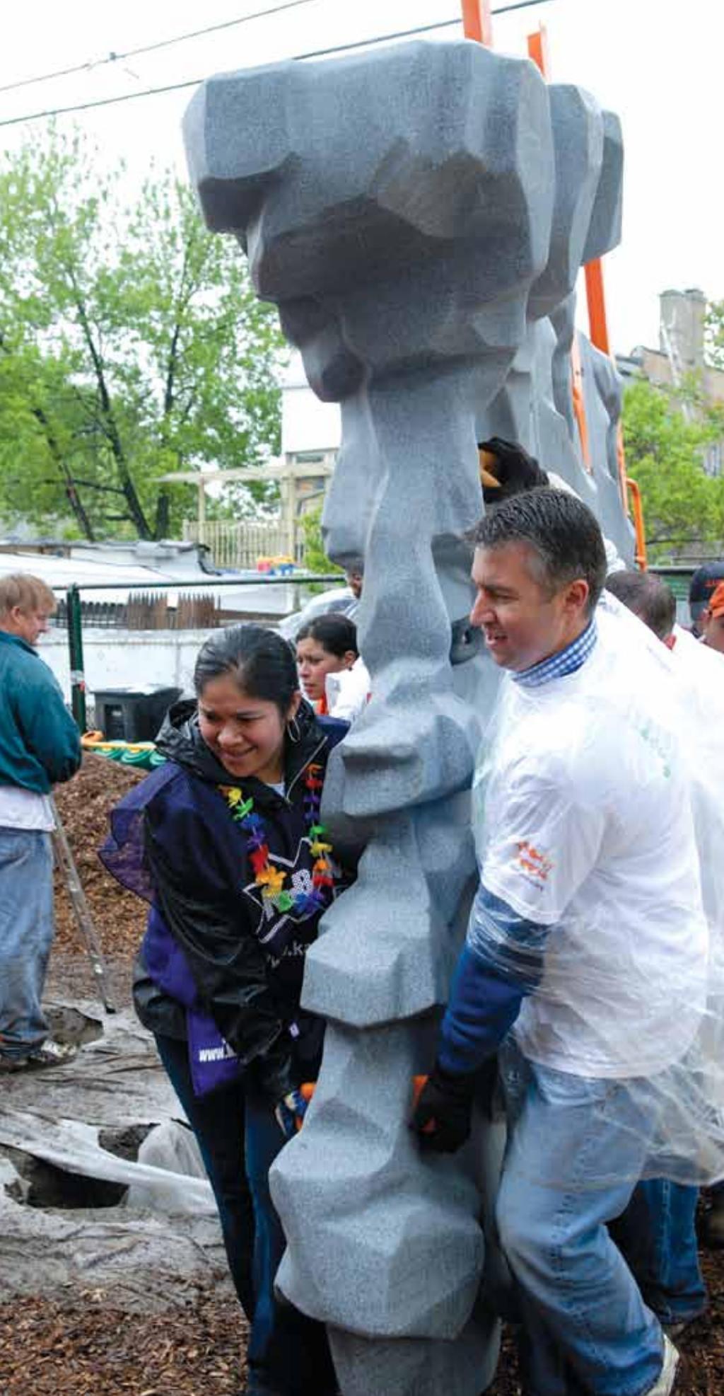
Residents and a local nonprofit collaborate to build a playground in Chicago's Little Village neighborhood.