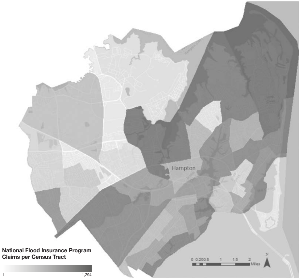
Cumulative NFIP Claims per Census Tract in the City of Hampton, VA, as of March 31, 2019