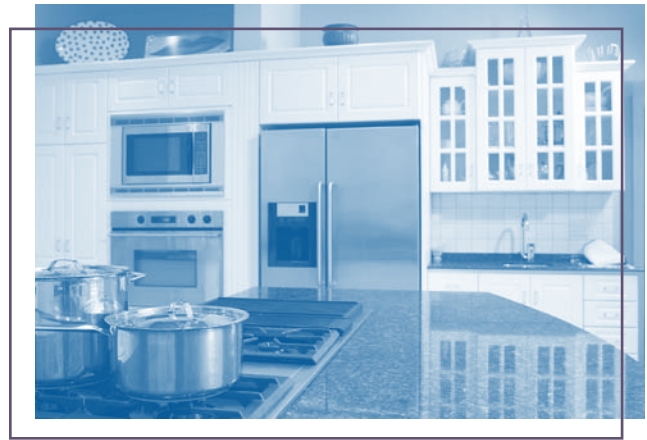
Energy-efficient appliances reduce energy usage and utility bills.

The Energy Star mortgage is designed to encourage homebuyers to purchase homes certified by the federal Energy Star program. These homes are certified to be at least 30 percent more energy efficient in comparison to the 1993 National Model Energy Code standards, or 15 percent more efficient than required by the state energy code, whichever is the higher standard. It includes most features of an EEM, plus additional features such as closing cost discounts, interest rate discounts, or coverage of HERS ratings costs.