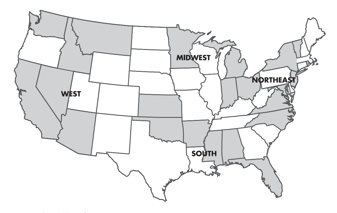
Exhibit 6.1. States With Properties With a Second LIHTC Allocation

real patterns, it appears that new allocations are not used primarily to meet the capital needs of properties for which systems are reaching the end of their expected lives. They are used more often by nonprofit owners than the percentage of all early year LIHTCs that had nonprofit owners, 14 versus 10 percent. This makes sense, since HFAs are likely to look favorably on applications from nonprofits because of their concern for long-term stewardship and their lower emphasis on financial return via cash flow.