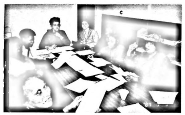
HUD-funded homeownership training for public housing families.

homeownership for highly motivated families and create more mixed- income and stable communities of working families.