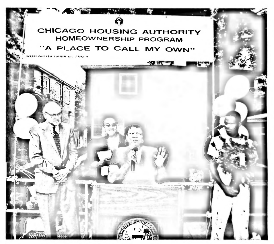
The Chicago Housing Authority launching its new Homeownership Program in July 1996. The goal: private homeownership for 2,000 public housing families.

Those families living in public housing who do not currently have jobs, perhaps receiving unemployment compensation or welfare payments, may not yet be financially ready to own their own home. For many of these households, the opportunity to become a homeowner can serve as a major incentive to obtain skills education and job training, to search more actively for paid employment, and to begin saving for a downpayment on their American Dream home. Through the increasing availability of lease-purchase programs that enable families to pay rent that can later be converted to monthly home mortgage payments, they can now work harder and move faster towards private homeownership than many of them ever thought possible.