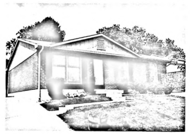
New home and homeownership for a former public housing family in Lexington, Kentucky.

Some of the cities have recently revived long-delayed Turnkey III programs, with homes built years ago AA public housing authorities but never sold, until neve under new HUD and local leadership. The best examples is New Orleans, Louisiana, where the Housing Authority is about to close on the first 10 homes of over 100 ready for sale in Christopher Park. Other cities that have been actively completing Turnkey III develop-