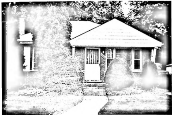
Scattered-site public housing sold to a resident family for homeownership in Detroit.

The "Motor City" was once a beacon of American homeownership, but population and job losses in the past few decades have taken their toll. Currently Detroit is experiencing a rebirth of economic