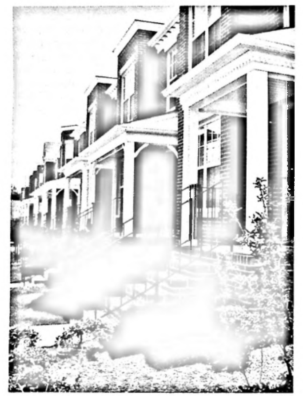
New townhomes in Richmond's historic Carver neighborhood, sold to public housing families on a "rent-to-own" plan.

The Richmond Redevelopment and Housing Authority (RRHA) has made promoting homeownership a centerpiece of its urban revitalization and family selfsufficiency activities. Indeed, RRHA's 1994 annual report, entitled "A Home of My Own," focuses primarily on Richmond's ambitious neighborhood homeownership initiatives. Two of these program efforts are especially targeted at enabling public housing families to graduate into private homeownership.