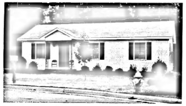
New homeownership for former public housing family in Highpoint, North Carolina.

Many housing authorities have been very aggressive in recycling the revenue from previous sales of public housing, using the sales proceeds to build additional new homes for sale to public housing families. High Point, North Carolina, for example, is building a new 15-home subdivision, and all of the homes are presold; Johnston, Rhode Island is using sales revenue to buy existing homes and sell them in a continuous cycle; in Broken Bow, Oklahoma, the Housing Authority has built and sold 24 homes and plans to build and sell 100 more; Toledo, Ohio's Lucas Metropolitan Housing Authority has sold over 60 homes to public housing