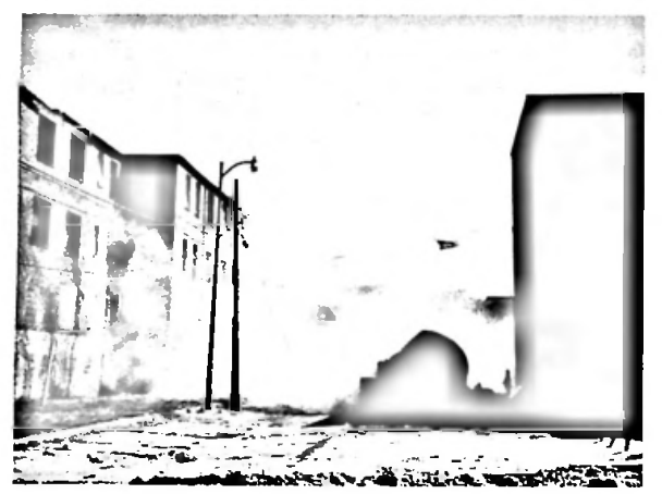
Demolition of the long-vacant Ellen Wilson public housing in Washington, D.C. clears the site for development of affordable homeownership.

When the renovation and sale of the first 57 homes is completed, the DCHA plans to sell the remaining vacant houses, and then to sell the occupied homes, with first priority of homeownership opportunity made available to the public housing families living there. At the same time, the D.C. Housing Authority is working to expand homeownership in several other ways. In its reconstruction of the now-demolished Ellen Wilson public housing development located on historic Capitol Hill, the DCHA is working with the Telesis Corporation, a private developer, to build 134 homeownership townhomes. HUD has provided $25 million in HOPE VI grant funds for the demolition and redevelopment of the Ellen Wilson site. In addition, the DCHA is currently planning to convert 92 public housing townhomes at Capitol View to