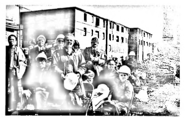
Local public housing families and other guests watch and celebrate demolition at the Ellen Wilson site.

Finally, the DCHA, working with HUD and numerous private sector, foundation, and community groups, will actively encourage public housing families to become private homeowners, particularly in the steadily expanding stock of new and rehabilitated homes made available through efforts of CDCs such as the Development Corporation of Columbia Heights, one of 9 nonprofit developers of the affordable new Nehemiah homes and a neighborhood shopping center at 14th and Belmont Streets, N.W. Many effective community development organizations operating in the nation's capital, such as the Marshall Heights CDC, Manna, Jubilee Housing, the Enterprise Foundation, LISC, the Neighborhood Reinvestment Corporation, Habitat for Humanity, and numerous others, including the newlyformed, Industrial Areas Foundation-organized, church-based Washington Interfaith Network (WEN), can contribute to the success of this public-private partnership to expand homeownership opportunities for public housing families.