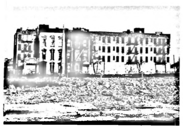
Before homeownership: a deteriorating neighborhood in East Brooklyn,

In many cases public housing families do not want to buy the housing they are currently renting, nor do they always receive assistance from public housing authorities to become private homeowners. Yet every year hundreds of public housing families move up to their American Dream: owning a home of their own. They accomplish this landmark achievement in their