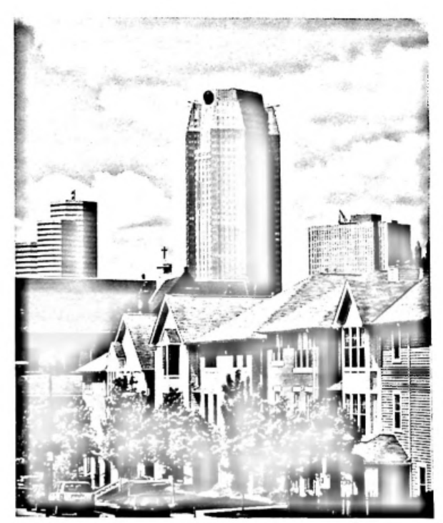
Affordable new homeownership, including by former public housing families, in Crawford Square near downtown Pittsburgh.

there was once deterioration and abandonment. Crawford Square is a $55 million, 18.5 acre, mixed-use, mixed-income community planned for 550 new homes and apartments along with an expanded shopping center, entertainment and cultural center. Crawford Square — a partnership between a private developer, McCormack Baron, a private lender, PNC Bank, Pittsburgh's Urban Redevelopment Agency and its various subsidiaries, and two non-profit neighborhood organizations, the Hill Project Area Committee and the Hill Community Development Corporation represents the largest single neighborhood development and the first new large-scale homeownership construction within the city of Pittsburgh in several decades. HUD is also a key partner, having already provided over $2 million in grant funds to support the development of Crawford Square.