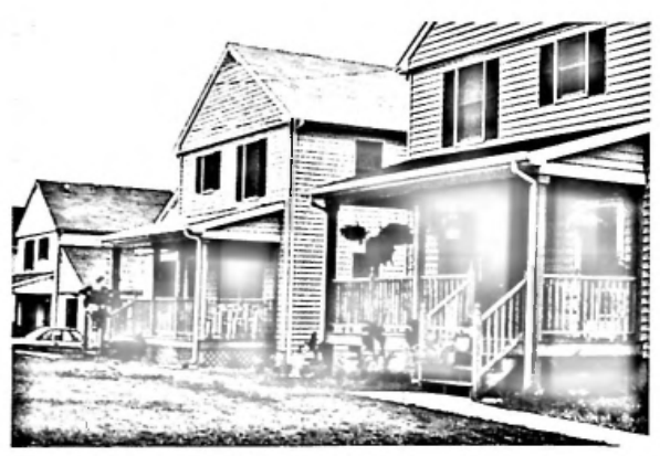
New homeownership for public housing families in Lynchburg, Virginia.

families and plans to use the revenue for its extensive public housing sales to fund an ambitious local homeownership initiative; in Battle Creek, Michigan, the Housing Commission leveraged the sale of 88 homes into the construction and sale of 69 more; in San Benito, Texas, the Housing Authority is using funds from home sales proceeds to pay for development of 19 additional homes; and in Millville, New Jersey, the Housing Authority is using revenue from the recent sales of 28 homes to provide grants for low-income first-time homebuyer families.