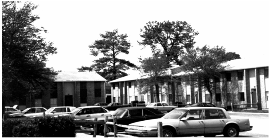
Photo 2.6 This apartment complex is typical of the developments in North Newport News into which Woodsong residents moved. (Carole Walker)

the East End have migrated north over the past few years, this is considered a better section of town than the area where Woodsong is located. The median household income in North Newport News is twice that of the Briarfield neighborhood ($27,838 versus $12,150); its minority concentration is much less (28 percent black versus 79 percent); and a significantly smaller percentage of the population receives public assistance (6 percent versus 25 percent). Less densely developed, the area is a mix of apartment complexes, strip commercial uses along the thoroughfares, and developments of single-family houses. Development in this area is newer than Briarfield, but, in general, not as new as Denbigh.