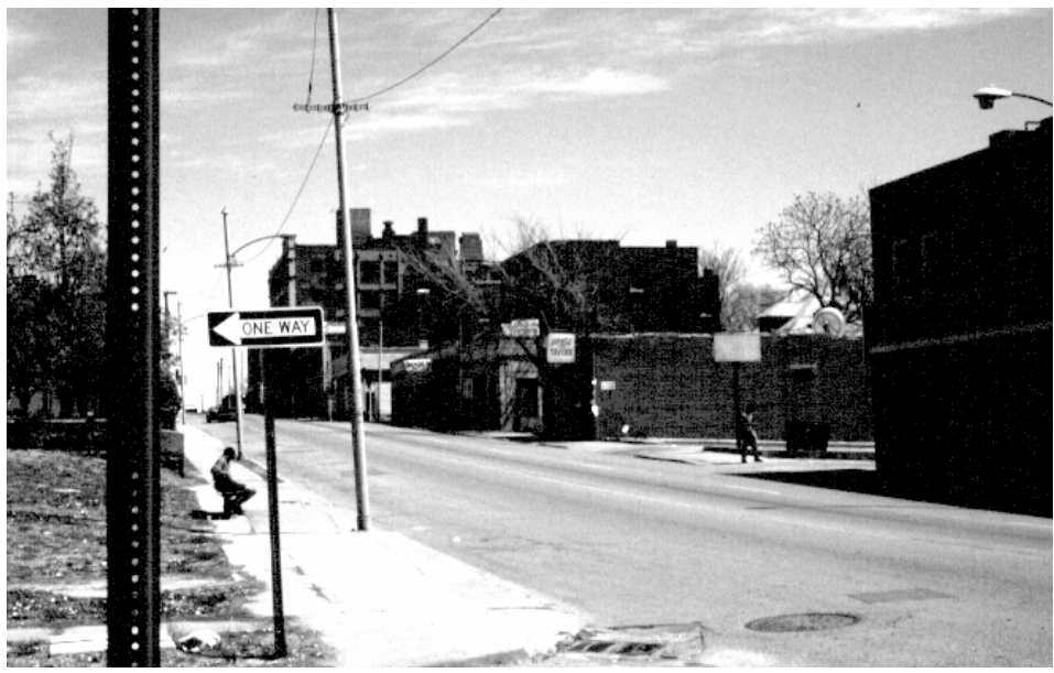
Photo 3.2 Thirty-first Street in Hyde Park, a commercial road servicing Creston Place residents, is characterized by physical deterioration and abandonment. (Kirk McClure)

neighborhood's many problems with crime and deterioration. Some of this gentrification is happening within only a few blocks of the Creston Place site. However, this gentrification is not widespread. Relative to the total stock of housing in Hyde Park, only a few homes are involved; but it is a change in direction for the physical stock of buildings in the neighborhood. Other neighborhood improvement efforts have been undertaken by a partnership of public and private groups. For example, just two blocks from the Creston Place site, a new hospice center for AIDS patients has been built. This new and architecturally impressive structure represents the first nonresidential building to be built in the immediate area around Creston Place in decades.