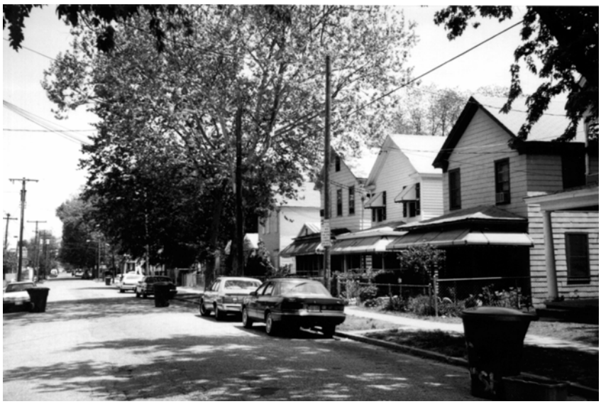
Photo 2.5 A sizable number of Woodsong residents relocated to the Southeast Community, an older section of Newport News containing mostly single-family homes. (Carole Walker)

some are within walking distance. Most area residents, however, rely on public transportation to reach major shopping areas, employment, and social services located north of Mercury Boulevard. A community center with tennis courts, a baseball field, basketball court, and swimming pool serves the Southeast Community and is centrally located.