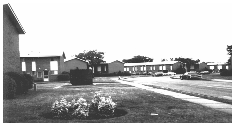
Photo 2.4 This older, well-maintained development in Newsome Park became home to numerous Woodsong residents.

The apartment development is an attractive and well-maintained older townhouse development. Private entrances face the street; there are large grassy areas and interior parking courtyards. In the opinion of informants, the development is well-managed and represents an improvement for Woodsong residents. Rental standards are rigorous, and potential renters are given a thorough background check before they are accepted.