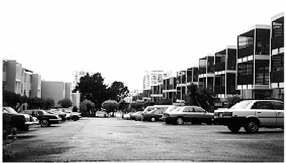
Photo 4.4 Low-rise multifamily development at Old Saint Francis Square, Western Addition.

The blocks between Webster and Gough Streets contain the lowest quality housing stock in the Western Addition, consisting almost entirely of low-rise public and assisted housing complexes in various states of disrepair. The Old Saint Francis Square development, occupying the block between Geary, Eddy, Webster, and Laguna Streets, appears to be well-maintained. The southern portion of Tract 161 (east of Webster) evidences a high degree of poverty in its run-down, bleak, low- and high-rise assisted housing projects.