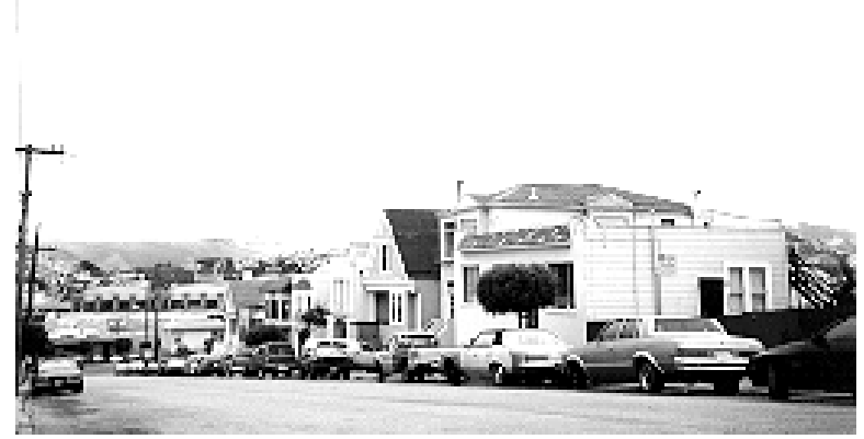
Photo 4.3 Typical neighborhood in Census Track 230, Bayview/Hunter's Point. (Joanna Davis)

The major thoroughfare serving Bayview/Hunters Point is Third Street. The bulk of industrial land uses are located on the eastern side of Third Street, with the densest concentrations in Census Tracts 606 (site of the shipyard), 232, 233, and 234. The residential stock is comprised primarily of low-rise single-family and multifamily structures.