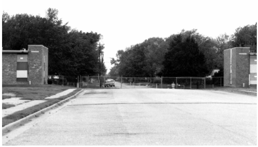
Photo 2.2 Worsening crime led to the erection of fencing limiting access to the property.