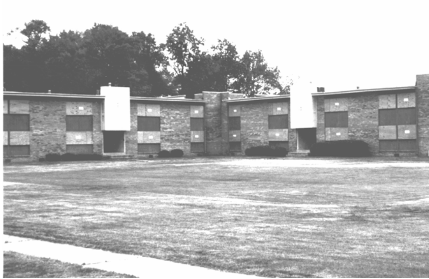
Photo 2.1 Woodsong and one of its interior courtyards, Newport News, Virginia.

Woodsong I and II were two-story walk-ups faced with brick veneer and wood. The complex contained 120 one-bedroom apartments, 240 two-bedroom apartments, and 120 three-bedroom apartments.