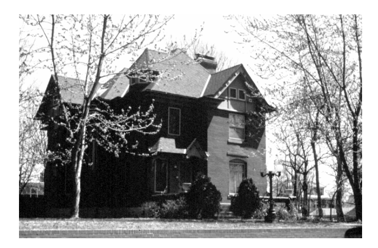
Photo 3.1 This turn-of-the-century mansion captures Hyde Park's former glory. (Kirk McClure)

Drive along the area today and there, still detectable, are glimmers of the area's former glory. Most of the homes still appear tidy. The old three-story frame and limestone ones maintain their elegance. Several turn-of-the-century homes have decorative stained-glass windows and wraparound porches. Even some new homes have been built at 27th and Campbell Avenue. (Rice 1996)