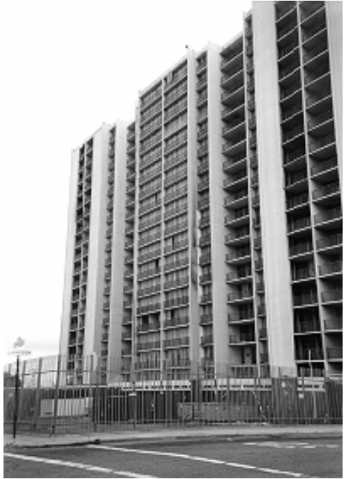
Photo 4.1 Close-up view of Geneva Towers, Visitacion Valley. (Joanna Davis)

Geneva Towers was built in 1964 by a private developer named Joe Eichler to house middle-income workers employed at the then-expanding San Francisco International Airport, located within a five- to ten-minute drive of the property. Geneva Towers, now slated to be demolished, contained a total of 576 units in two high-rise towers built of pre-stressed concrete (see Photograph 4.1). The complex had no outdoor play areas and was not designed to accommodate families with children.