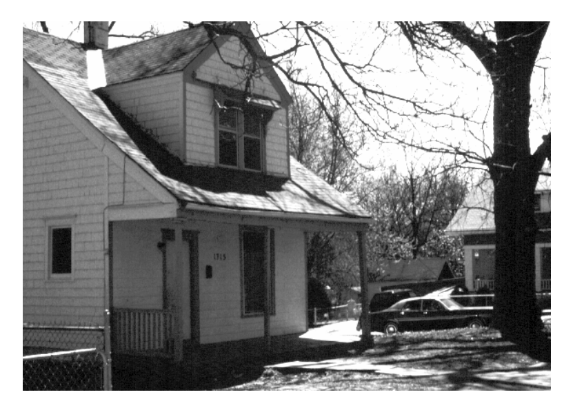
Photo 3.6 Some larger families who were unable to find apartment units big enough to accommodate them instead chose single-family units similar to the one shown here in the East/Central neighborhood of Kansas City.

Although housing conditions and access to recreation activities and green space may have been improved, access to shopping may have worsened for those moving to the East/Central area. The Hilltop Homes development, for example, is located adjacent to a large municipal park with open space, baseball fields, and recreational facilities. However, the only commercial establishments in close proximity to the development are a small laundromat and a liquor store that sells packaged "junk food." The nearest commercial area is more than one mile away, certainly a long walk if carrying grocery bags. Further, the development is also far away from any restaurants, grocery stores, or other businesses that have managed to survive in the Midtown/South and Downtown areas.