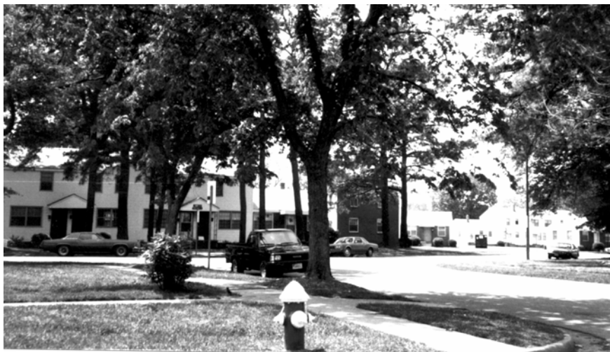
Photo 2.3 A large number of Woodsong residents stayed within the same neighborhood, moving across the street into the townhouse development shown here.

activities that went on at Woodsong. However, because it is older and not constructed of masonry, housing conditions at this complex were rated somewhat poorer than at Woodsong on the windshield survey. At the time of the vouchering out, it also had a high vacancy rate, as evidenced by the large number of Woodsong residents who relocated there (51).