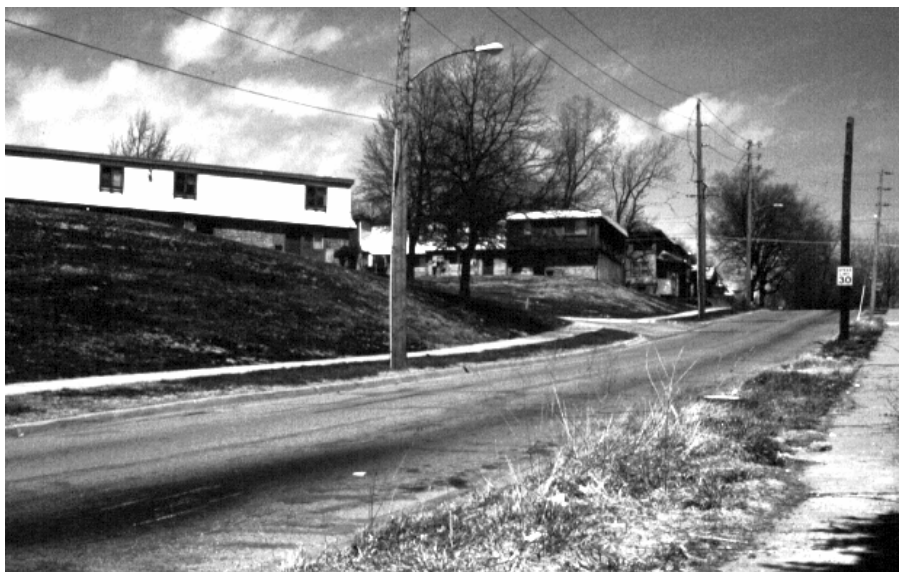
Photo 3.5 Located in the East/Central neighborhood of Kansas City, Hilltop Homes was the destination of several Creston Place residents. (Kirk McClure)

Some of the tenants who moved from Creston needed several bedrooms because of their large family size. These households generally found that they could not be accommodated in the standard apartment buildings. Rather, these large families had to find a single-family dwelling unit to obtain enough bedrooms. These single-family units were dispersed throughout the city, but many were located in the East/Central area. Although the units into which the Creston Place voucher recipients moved were inspected and had to meet Housing Quality Standards, a windshield survey conducted by the author of single-family homes in this area showed that they appeared to be in poor condition. They tended to be older (pre-World War II) wood-frame homes on narrow lots. Rarely did the homes have a driveway or a garage; parking was on the street. The need for investment in the exterior of the homes was obvious. Painting and repairs were needed on siding, doors, windows, porches, and roofs. The lots also tended to be in poor condition with little or no attention given to the grass, shrubs, or trees. Typically, the front lots of the homes were little more than bare ground.