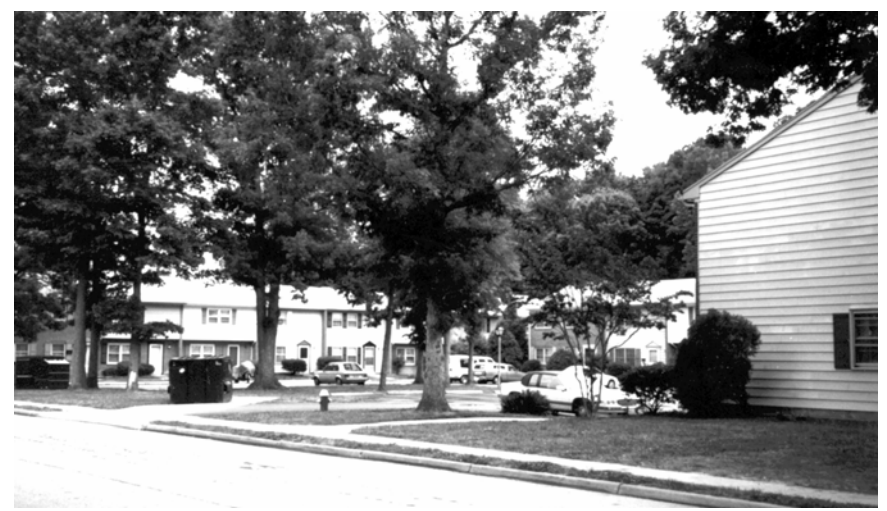
Photo 2.7 Some Woodsong residents moved to Denbigh, a middle-income, more racially mixed area in the northern part of Newport News with attractive and well-maintained developments like the one shown here.

The 33 voucher recipients who moved to Denbigh, in the northern part of Newport News about ten miles from Woodsong, experienced a notable change in neighborhood conditions. Denbigh, compared to the Briarfield neighborhood, has a lower concentration of minorities (35 percent black), twice the median household income ($26,648 versus $12,150), and a smaller percentage of the population relying on public assistance (7 percent versus 25 percent). To some extent, however, these data mask the variation that exists among the three census tracts in Denbigh where Woodsong residents moved. Six of 33 residents relocated to a less affluent census tract (322.12), while 27 of the residents moved into tracts (320.03 and 322.22) where fewer households rely on public assistance (7 percent and 5 percent, respectively), median incomes are higher ($29,816 and $26,924, respectively), and more units are owner-occupied (54 percent for both census tracts).