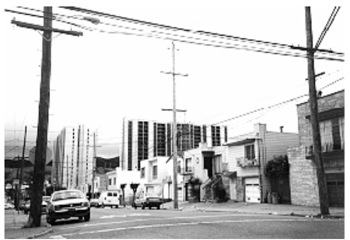
Photo 4.2 Geneva Towers and surrounding neighborhood, Visitacion Valley. (Joanna Davis)

The physical appearance of the high-rise Geneva Towers was in sharp contrast to the character of the single-family neighborhood that surrounded it, causing Geneva Towers to stand out dramatically and generating substantial controversy about prospects for the property's future (see Photograph 4.2).