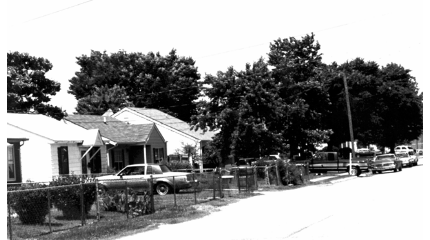
Photo 2.8 Located next to Newport News's Southeast Community, neighborhoods like the one above in the Wythe/Old Hampton section of Hampton became home to former Woodsong residents. (Carole Walker)

in a grid pattern, most with sidewalks and closed storm sewers, although some have open drainage ditches. The city of Hampton has been putting a lot of money and energy into revitalizing the neighborhoods in this area. There was a feeling expressed by some of the informants that moving to Hampton represented an improvement for the voucher recipients, but others believed that the boundary between the cities means little and that the recipients were just looking for vacant housing and happened to find it in Hampton.