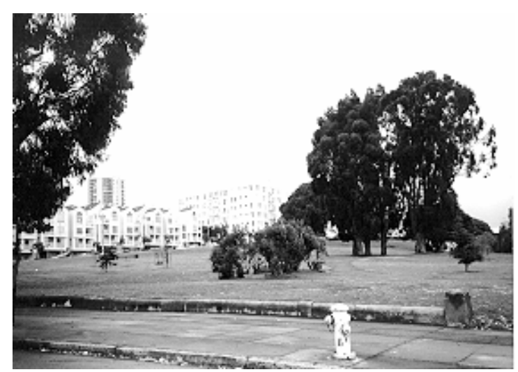
Photo 4.5 Jefferson Park and recently constructed multifamily developments, Western Addition.

The Western Addition has the advantage of plentiful green space and several playgrounds interspersed throughout the urban setting. Alamo Square, adjacent to Census Tract 168, is a large grassy park with stately trees and views of City Hall and the Civic Center area. The famous, picturesque Victorian houses that form a solid block bordering Alamo Square are the backdrop for many familiar movie and television location shots (e.g., the opening sequence for Full House ). There are also numerous school playgrounds in the area, including Benjamin Franklin Middle School on Geary Street, which has a baseball field. In Census Tract 161, across the street from the assisted housing projects, there is a two-block-long park containing an open grassy space, a baseball diamond, and playgrounds.