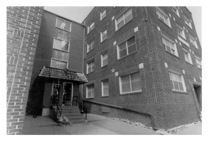
Photo 3.3 Frontal view of Creston Place, Kansas City.

The buildings were reported to have been built at various dates; the best guess appears to be during the 1920s, the era when this neighborhood was being developed as a streetcar suburb of the Downtown area. The buildings were rehabilitated using Section 236 assistance in 1974. The project subsequently experienced financial trouble and was given Section 8 Loan Management Set-Aside assistance in an effort to keep it viable.