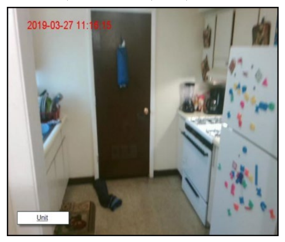
Exhibit 4: Unit Inspection Within the Trinity Manor Apartments

Exhibit 4 displays a unit from the Trinity Manor Apartments, in Augusta, GA. The apartment complex was inspected on March 27, 2019, and received an overall inspection score of 36c* (HUD, n.d.c). The asterisk indicates that health and safety (H&S) deficiencies were found with respect to smoke detectors and lowercase "c" indicates that one or more exigent/fire safety (calling for immediate attention or remedy) H&S deficiencies were observed. The unit's door is displayed in the photo; however, it does not reveal the type of door (for example, closet, bathroom, entry) nor whether its locks are damaged or inoperable. One would need to physically operate the door to determine where it leads and whether the locks are functioning properly.